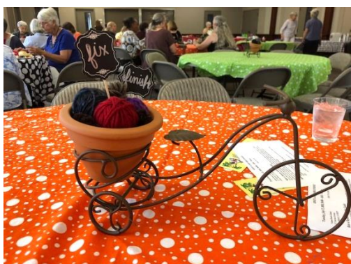
Fix and Finish centerpiece

Our members came together for the annual Pot Luck luncheon. We had a variety of delicious salads, homemade rolls, beverages, and desserts. We worked on our knitting projects and had more time for fellowship. An enjoyable time was had by all in attendance!