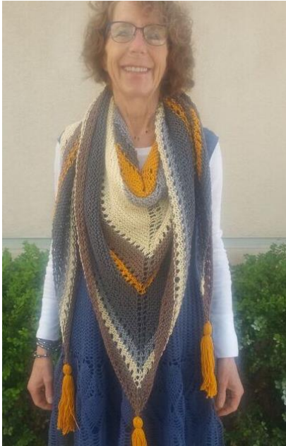
Monica Clark's version of the Coffee Shop Wrap uses 24/7 Lion Brand cotton yarn. It's an easy beginner pattern with style to spare. Free from designer Two of Wands .

Show and Share – for more photos, visit our website .