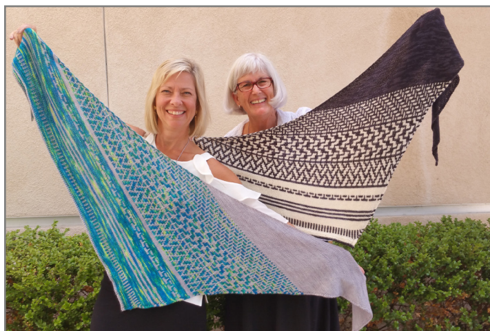
Cally Monster designed the Freeze Frame Shawl for handpainted or contrasting solid yarns. Because you're using slip stitches, you're working with only one yarn at a time. Both versions are pictured and more photos are on Ravelry.