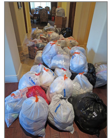
37 bags, 3 boxes and still counting!

Currently we have over 425 pounds of yarn to sell. That's the equivalent of 192,777 grams or 3,855 50-gram skeins or 1,927 100-gram skeins. That's a lot of yarn! We also have books, needles, kits, finished objects, unfinished objects, notions, spinning tools and fiber. My house is full! Thank you for your generous donations. If you have more to donate and you can store it for a few months, please save it for next year's stash sale. If you absolutely must get it out of the house now, I will reluctantly take more up until the August Guild meeting.