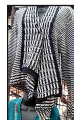
L to R: Baah! Yarns booth. Pawley Studios yarn bowls for every decor. Trendsetter's Striped Angle Cardigan, new for Spring 2016.