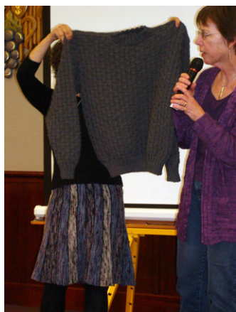
Amy Sheridan shared "Basic Crewneck" by Ann Budd. She used Knit Picks Swish, a wool superwash, in grey. It is done in a basket weave stitch from one of Barbara Walker's books.