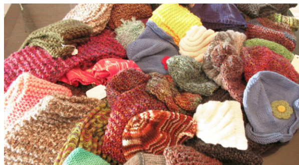
Here are more hats and scarves made by Guild members . . . Thank You.

Guild hats have been donated by Tête-à-Tête Hats to many facilities including Scripps Hospital, Scripps Mercy Hospital, Rady Children's Hospital, St. Jude Children's, Little Company of Mary, Torrance Memorial Hospital, Scripps