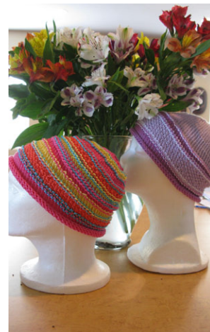
These hats were made with leftovers of Tahki Cotton yarn.

For our spring and summer donations to Tête-à-Tête, Philanthropy is in need of lightweight yarns and hats. We need lightweight acrylic, cotton and cotton blend yarns. Please go through your stash and bring in your leftover lightweight balls of yarn, large and small...we will take it all