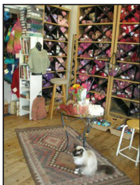
Common Threads 191 N. El Camino Real #201 Encinitas, Ca. 92024 760-436-6119