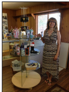
Kat's Yarn & Craft Cottage 2112 Fourth St. Julian, CA 92036 Phone: 619-246-8585