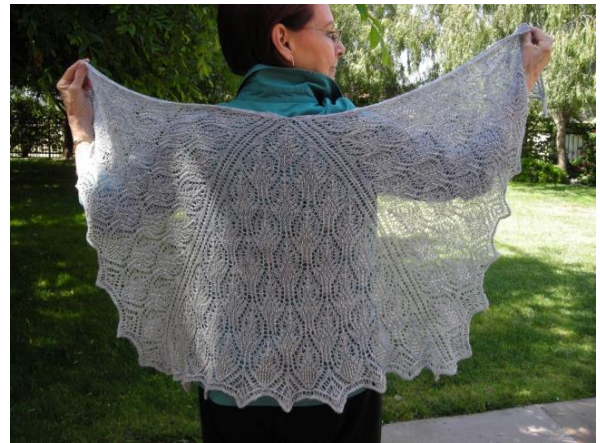
Sue Tavaglione knitted a silver grey beaded lace shawl from Vogue Winter 2005 . The yarn is Malabrigo Lace, Baby Silkpac, colorway Polar Morn.