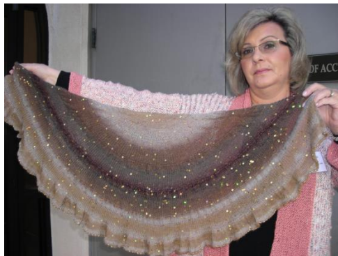
Thea also knitted a “Citron Shawl” from Ravelry using Fame yarn.