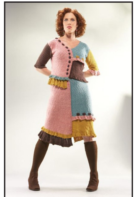
Ruffles and more ruffles.