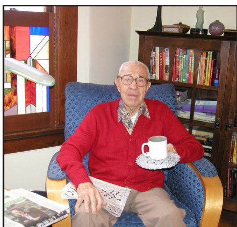
Here is my dad, holding the doily like a tray. Also, he's wearing a sweater that my mother knit, which I assembled for him after she died.

rack to dry. It was still wet the following week when I arrived, though fairly stiff at that point. The third week when I got there, this is what I found: once it was completely dry he spray painted it silver and placed it proudly on his side table. And he had gone back to using his filthy beer mat because mine was "too pretty to use."