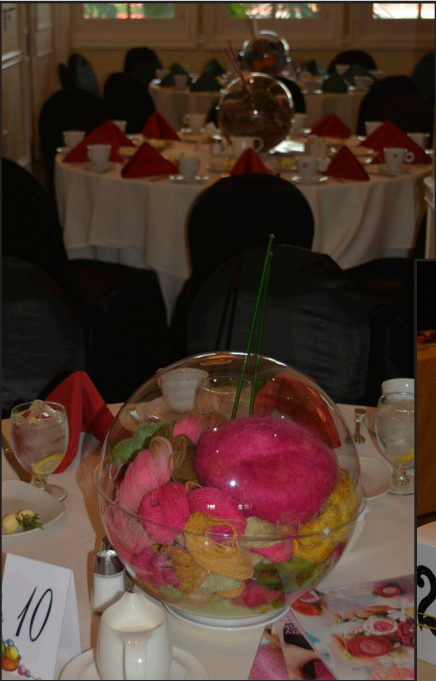
(Above) Luncheon Table Centerpiece, (Right) Sock Monkey Prize (Below) Swatch Afghan Prize