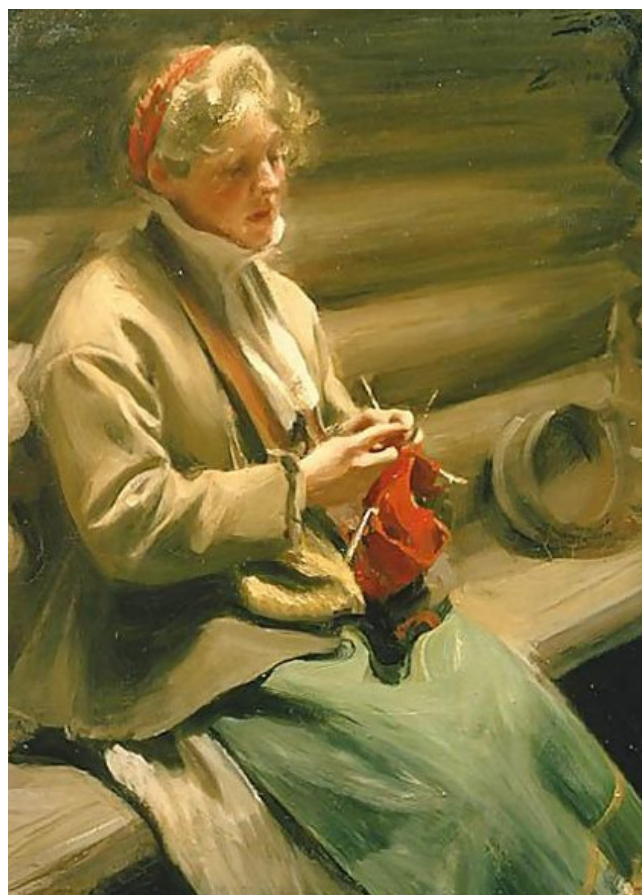
“Girl from Dalcarnia”- Anders Zorn