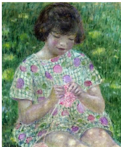
“Child Knitting”- Frederick Carl Frieseke