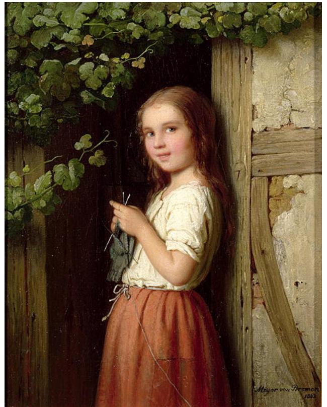
“Young Girl Standing in a Doorway Knitting” Meyer Von Bremen- 1863