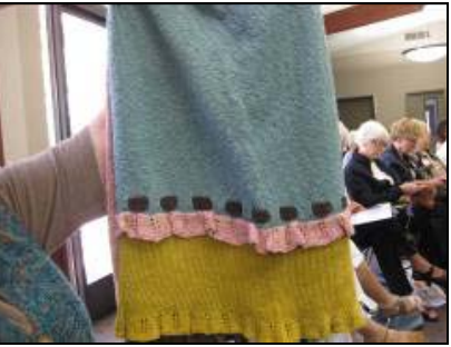
This long skirt is part of a suit set.