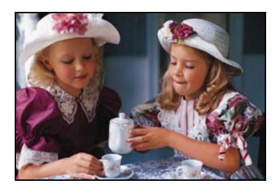
PLEASE BRING IN YOUR TEA PARTY CHALLENGES ITEMS!