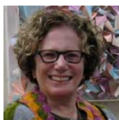
FROM BARBARA LEVIN

Watch me do a dizzying 180-degree spin from last month's message – when I urged you all to learn to read your newsletter on a computer. Today I am urging you to stay away from your computer and do your yarn shopping locally! We're blessed in Southern California with a dazzling array of local yarn stores. Let's help keep them alive!