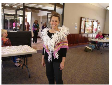
Stacy Smith-Made of shredded paper and wire.

Here are a few photos and we will post more on the web site!!!