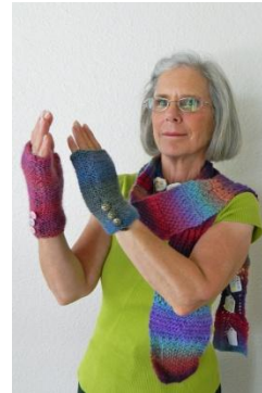
Eileen Adler’s original design is a scarf of Mochi Plus, 2 skeins, on size US 8 needles. Her fingerless gloves are knitted with one skein of Saulsalito sock yarn held double on size US 5 needles.