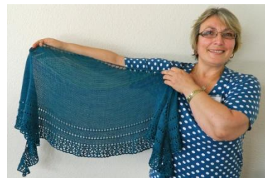
Mimi knitted another shawl, “Sugared Violets”, by Rose Beck, using Knit Picks Essential yarn, about 500 yds. on size #7 needles.