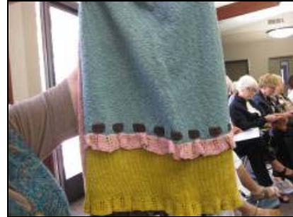
This long skirt is part of a suit set.