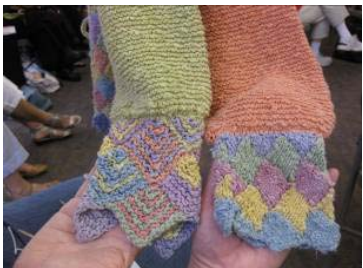
Details of the Sleeves