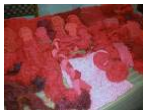
Red Scarves Galore!

Look At All The Great Work Our Guild Is Doing!!!