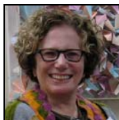
FROM BARBARA LEVIN

It's time for a big round of applause for all the volunteers who have stepped up to knit for the guild's philanthropy projects. In January, the board voted to take some of the money from last year's successful fundraisers and spend it on yarn for charity projects. We had two goals in mind: to make knitting for charity a "no-brainer" by handing out ready-to-cast on kits with yarn and pattern included, and to throw some support to our terrific local yarn stores.